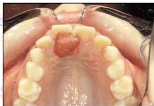
Fig. 1 Maxillary lesion showing solitary, pedunculated, reddish pink swelling on palate with distinct border and irregular surface

attain the present size. The growth was asymptomatic. The patient's medical history was unremarkable. Intraoral soft tissue examination revealed a solitary, pedunculated, spherical-shaped, reddish pink swelling with distinct border and irregular surface and it was located in the anterior part of lingual surface just lateral to the midline on right side in area between maxillary central incisors measuring 1.2 cm x1.8 cm in size. (Figure 1)